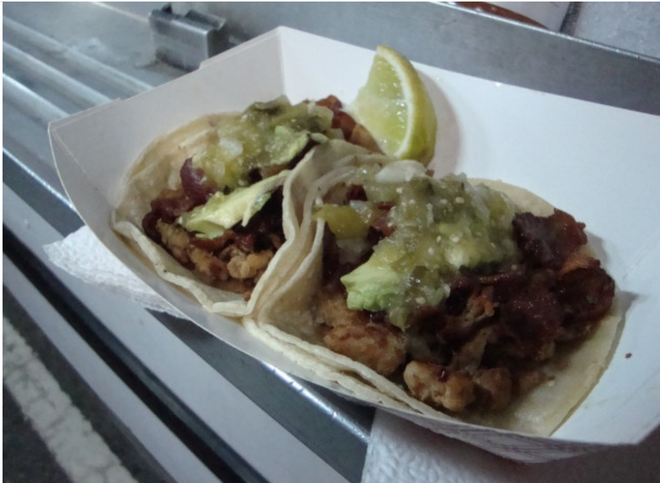
Kung Pao Chicken Tacos f/ Grilled Onions and Bacon